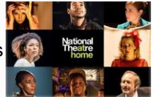
National Theatre home

National Theatre: In response to the school closures the National Theatre is offering username and password access to the National Theatre Collection. For a temporary period, some of the best plays can be accessed remotely ensuring pupils studying from home can still watch them.