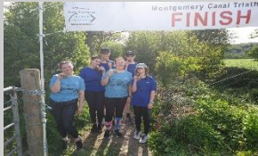
The team with their gold medals for completing all three sections in one go at the end of 27 miles.

Four Year 10 pupils and two staff from LDA successfully completed the Montgomery Canal Triathlon, a 27-mile triathlon in North Wales. The challenge involved them cycling 12 miles and canoeing 5 ½ miles before run/walking 9 ½ miles as a team which they achieved in just over 7 hours.