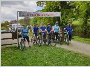
The team at the end of the cycling section which was just over 12 miles long.