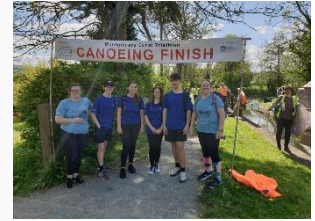
The team at the end of the canoeing section, 17.5 miles completed, about to start the final 9.5 miles.

If you would like to support the group in increasing the amount raised, sponsorship monies can be handed in to reception (in a clearly labelled, sealed envelope) or Miss Munroe.