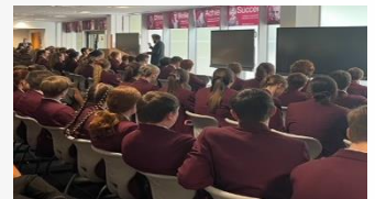
Year 11 – Final advice and guidance before the GCSE Biology exam